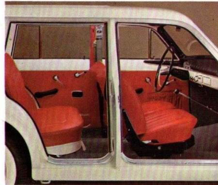
Wide doors give easy access to the elegant interior.

This Station Wagon is spacious and versatile. Its roomy interior combines passenger car comfort with the load carrying capacity of a small truck. It is economical and hard wearing in both functions. As a passenger car, it seats five adults comfortably, luggage space is generous. A few simple adjustments convert it into a two seater with a load 72" deep, 34" high, 50" wide. The rear opening divides horizontally; the upper half may be opened from the inside. The rear compartment floor is low for ease of loading and unloading. Fragile or light packages are protected by a durable, attractive textile floor mat. The interior is completely lined with practical and smart leatherette.